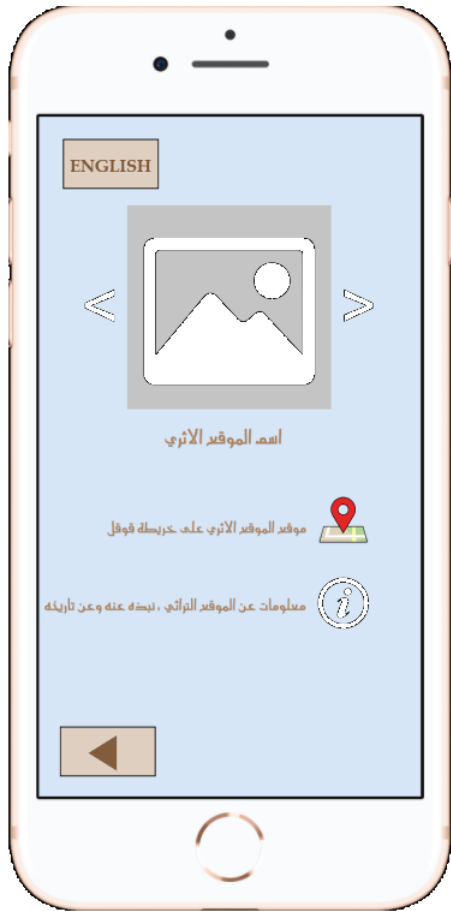
Fig 4 : A page contains pictures of the archaeological site, information about it and its location in Arabic .