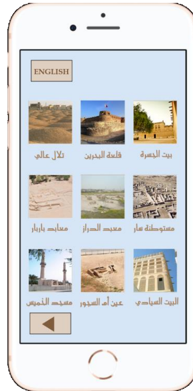
Fig 2 : An exhibition of Bahrain's heritage and archaeological sites in Arabic