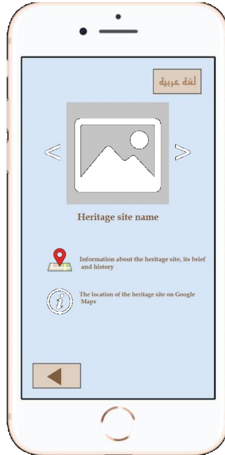
Fig 5 : A page contains pictures of the archaeological site, information about it and its location in English .