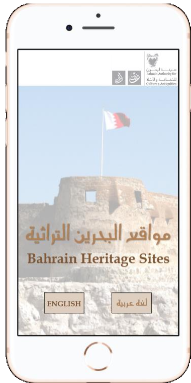
Fig 1 : the application interface